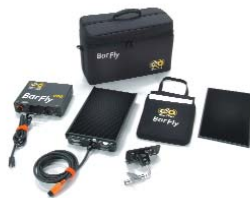
KIT-B200-G120 BarFly 200 Kit, 120VAC (1-Unit) w/ Soft Case