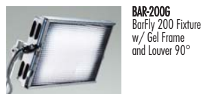
BAR-200G BarFly 200 Fixture w/ Gel Frame and Louver 90°