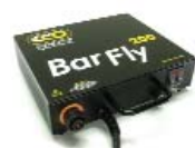
BAL-207-G120 BarFly 200 Ballast, 120VAC