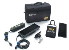
KIT-B100-G120 BarFly 100 Kit, 120VAC (1-Unit) w/ Soft Case