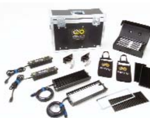
KIT-B12-G120 BarFly 100 Kit, 120VAC (2-Unit)