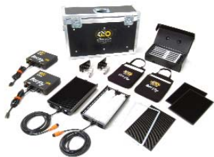
KIT-B22-G120 BarFly 200 Kit, 120VAC (2-Unit)