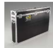
KAS-180-1 Image 85 Ship Case