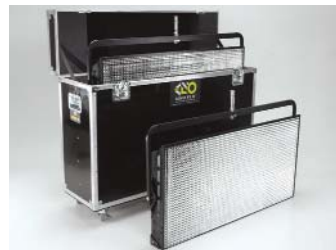
KIT-85-X2/120 Image 85 DMX Kit, 120VAC (2-Unit)