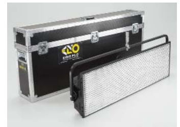
KIT-45-X1/120 Image 45 DMX Kit, 120VAC