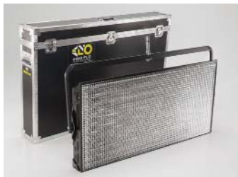
KIT-85-X1/120 Image 85 DMX Kit, 120VAC