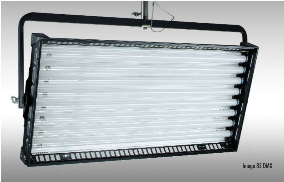
Image 85 DMX