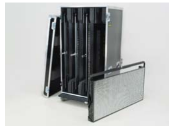
KIT-85-X4/120 Image 85 DMX Kit, 120VAC (4-Unit)