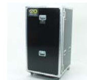
KAS-180-4 Image 85 Ship Case (4-Unit)