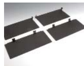
BRD-180 Image 85 Barndoors