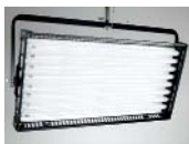
IMG-85X-120 Image 85 DMX, 120VAC