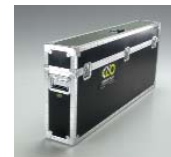
KAS-140-1 Image 45 Ship Case