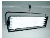
IMG-45X-120 Image 45 DMX, 120VAC