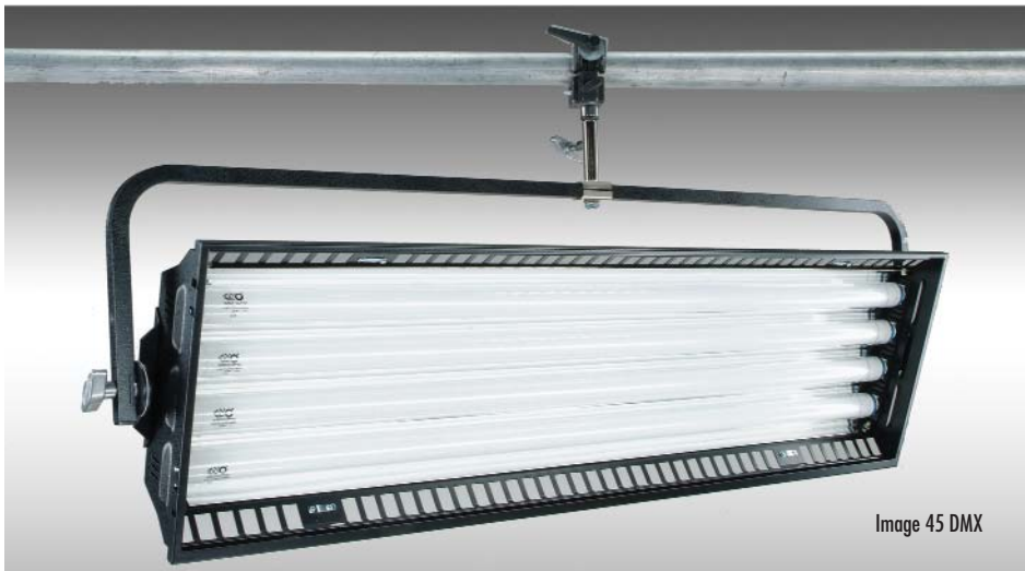
Image 45 DMX

The Image 85 DMX fixture's large soft light coverage and its small, energy footprint, combined with the ease of rigging compared to tungsten lighting sources makes it the darling of motion picture and television visual effects designers.