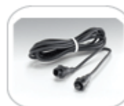
XM3-6 Extension, 6ft