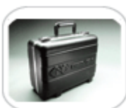
KAS-MC Travel Case