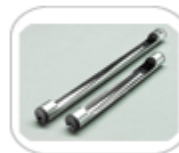
REF-150M 150mm Reflector