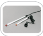
150-K32-H 150mm Kino KF32