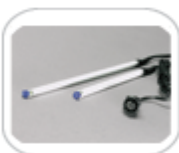
100-K32-H 100mm Kino KF32