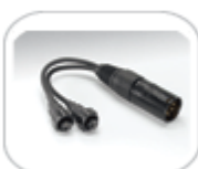
PWC-M2X Micro-Flo Splitter XLR