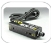
BAL-132 Micro-Flo Ballast, 12VDC