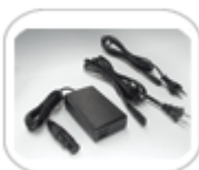
PWS-153X Power Supply 3.4A, 100-250VAC/12VDC XLR