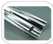
REF-4801 4ft Reflector