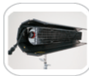
CFX-4801 4ft Fixture