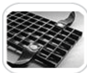
LVR-4801-B 4ft Louver/Black