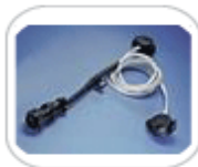
HAR-4801 4ft Harness