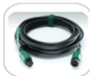
X04-25 Extension, 25ft