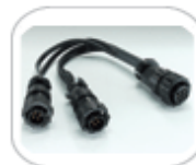
X04-A9 Single to Double Combiner