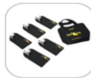
BAT-W1 Batwing Single Louver (5pk)