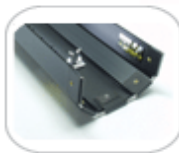
FIX-4801 4ft Fixture Shell