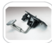
MTP-B41S Mount w/ Baby Short (16mm)