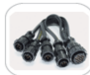
X04-A16 Single to 4Bank Combiner