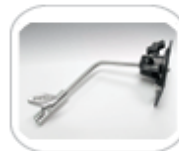
MTP-B41 Mount w/ Baby Receiver (16mm)