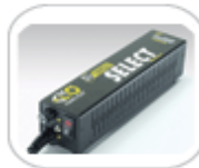
BAL-105-S120 Select/Ve Ballast, 120VAC