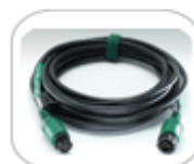
X04-12 Extension, 12ft