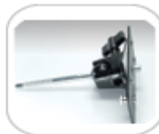
MTP-K41 Mounting w/ 3/8" Pin (10mm)