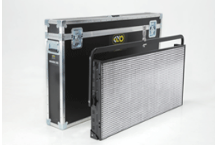
Image 85 DMX Kits