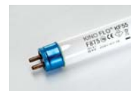
122-K55 12" Kino KF55