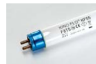
122-K55 12" Kino KF55