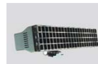
DES-121-120 Desk-Lite 121, 120VAC