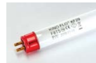
122-K29 12" Kino KF29