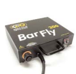
BAL-207-G120 BarFly 200 Ballast, 120VAC