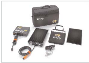
KIT-B200-G120 BarFly 200 Kit, 120VAC (1-Unit)

Dimensions Weight 31 x 19.5 x 10.5" 43 lb (77.5 x 49 x 26.5 cm) (19.4kg)