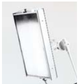
BAR-200G BarFly 200 Fixture w/ Gel Frame and Louver 90°