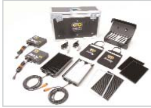
KIT-B22-G120 BarFly 200 Kit, 120VAC (2-Unit)