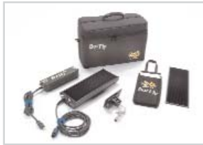
KIT-B100-G120 BarFly 100 Kit, 120VAC (1-Unit)

Dimensions Weight 27.5 x 19.5 x 10.5" 35 lb (69 x 49 x 26.5 cm) (15.8kg)