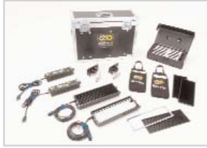
KIT-B12-G120 BarFly 100 Kit, 120VAC (2-Unit)