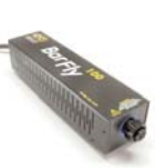
BAL-107-G120 BarFly 100 Ballast, 120VAC