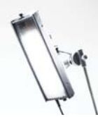
BAR-100G BarFly 100 Fixture w/ Gel Frame and Louver 90°