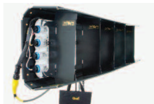
BatWing 4Bank Louver fits all 4Banks (2ft, 4ft, 6ft & 8ft) and Foto-Flo 400.