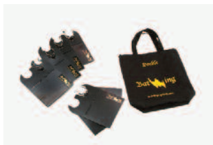
BAT-W2 BatWing Double Louver Kit, (5pk)