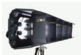
BatWing Double Louver fits all Doubles (2ft, 4ft, 6ft & 8ft).