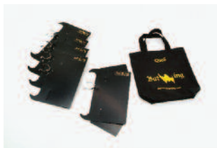
BAT-W4 BatWing 4Bank Louver Kit, (5pk)