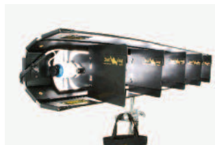
BatWing Single Louver fits all Singles (2ft, 4ft, 6ft & 8ft).