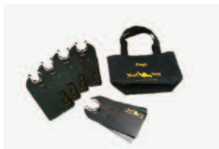
BAT-W1 BatWing Single Louver Kit, (5pk)