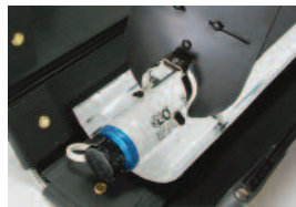
BatWing attaches directly onto Kino Flo safety coated lamps.