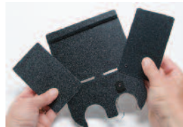
Adjustable height and angle