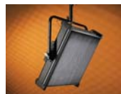
IMR-S6-120 Imara S6 DMX Yoke, 120VAC