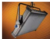
IMR-S10-P120 Imara S10 DMX Pole-Op, 120VAC