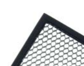
GFR-IM6 Imara S6 Gel Frame (Included)