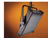
IMR-S6-P120 Imara S6 DMX Pole-Op, 120VAC