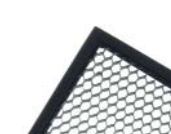
GFR-IM6 Imara S6 Gel Frame (Included)