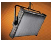
IMR-S10-120 Imara S10 DMX Yoke, 120VAC