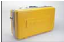
KAS-CE2 Celeb 200 Flight Case