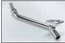
MTP-B41F Kino Offset w/ Baby Receiver (16mm)