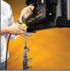
Mounted on a baby stand