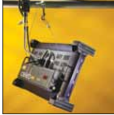
Mounted to pipe grid

The Celeb 200 includes a Lollipop w/ Baby Receiver (16mm) ( MTP-LB ) which allows the fixture to be mounted directly onto a baby stand or hung from a grid with a baby pipe clamp.