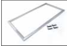
GFR-CE2 Celeb 200 Gel Frame