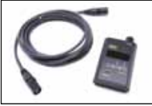
DIM-CE1 Celeb Remote Dimmer