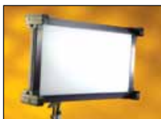
Celeb 200, 230U