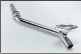
MTP-B41F Kino Offset w/ Baby Receiver (16mm)