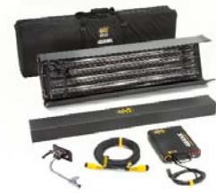
KIT-484B-120U 4ft 4Bank Kit, Univ 120U (1-Unit) w/ Soft Case