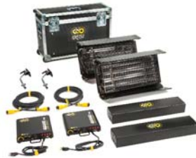
KIT-2NT-X120U Interview DMX Kit, Univ 120U (2-Unit)