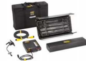
KIT-244B-120U 2ft 4Bank Kit, Univ 120U (1-Unit) w/ Soft Case