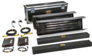
KIT-2GF-120U Gaffer Kit, Univ 120U (2-Unit)