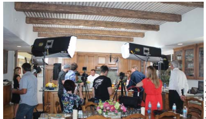
Elevated Media Productions