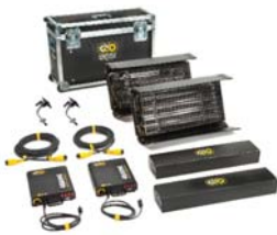
KIT-2NT-120U Interview Kit, Univ 120U (2-Unit)