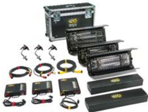
KIT-3NT-120U Interview Kit, Univ 120U (3-Unit)