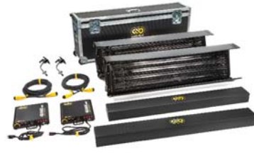
KIT-2GF-X120U Gaffer DMX Kit, Univ 120U (2-Unit)